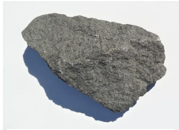
This sample of Heal Black Granite is one foot long and weighs 10 pounds.